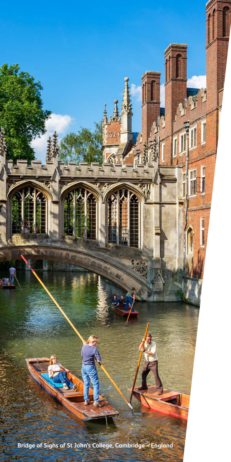
Bridge of Sighs of St John's College, Cambridge – England