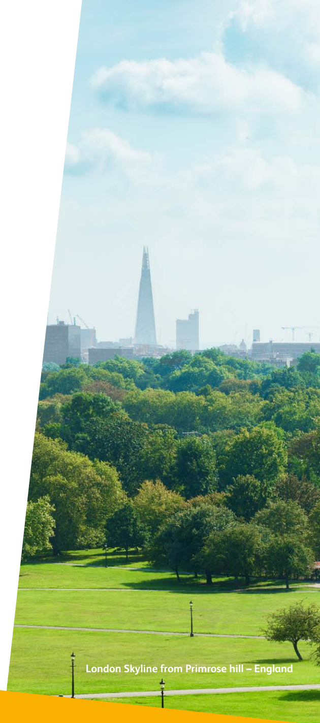
London Skyline from Primrose hill – England

As the UK's national admissions service, UCAS is for all students who wish to apply to a university or college in the UK. UCAS processed over 706,000 applications in 2019, including over 140,000 applications from outside the UK. Over 540,000 people were accepted onto courses, including nearly 77,000 from outside the UK, applied through UCAS to get their place at UK university or college.